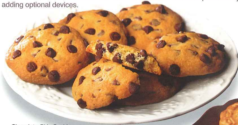
Chocolate Chip Cookie